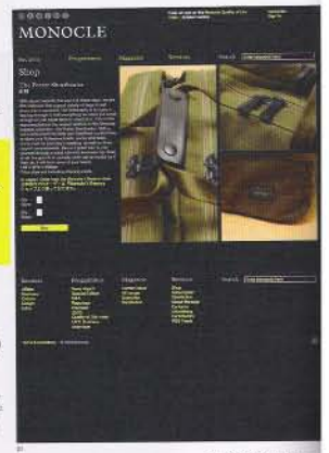
01 Monocle's Porter bags can be ordered on line. Log on to see our new retail movie created by Gaku Nakagawa

At monocle.com you can order our new fragrance HIRAKI Ona. It's produced for us by Comme des Garçons, our collection of Porter bags and also the Monocle-branded Skaggsport bicycles. To match everything we offer, we have even commissioned a short film to show off our wares.