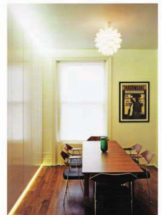
0120 7734 6055 www.williamtozer.co.uk 0120 7437 7775 enquiries@wtad.co.uk