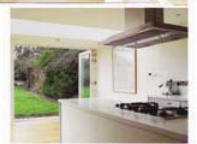
0120 7734 6055 www.williamtozer.co.uk 0120 7437 7775 enquiries@wtad.co.uk