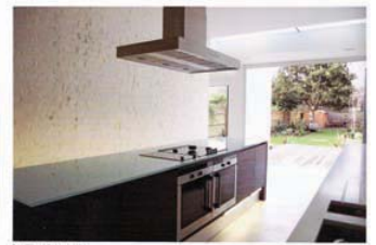
0120 7734 6055 www.williamtozer.co.uk 0120 7437 7775 enquiries@wtad.co.uk