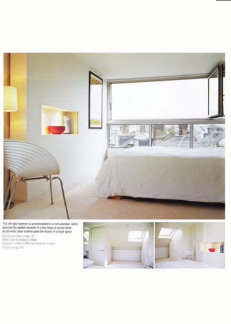
This left-side bedroom is accommodated in a half extension, which preserves the original character of a three-bedroom or living house. An all-white scheme allows glass the benefit of a large space. 2012/13, London, UK William Tozer Architecture & Design from Architecture & Design 88 pages, 40 images (16)