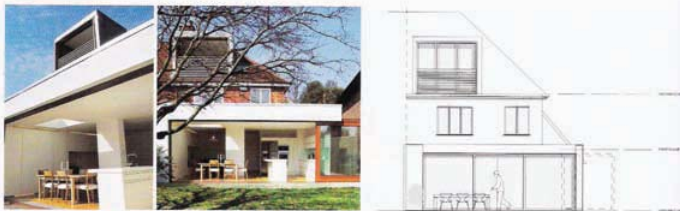
A large rear extension fuses this semi-detached house with the adjacent garden and reconfigures the adjoining spaces Semi Detached House, Sandridge (Herts), Kent, UK William Tozer Architecture & Design