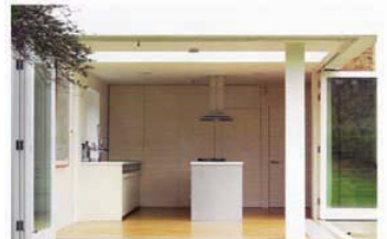
0120 7734 6055 www.williamtozer.co.uk 0120 7437 7775 enquiries@wtad.co.uk