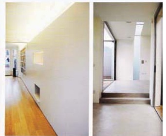
0120 7734 6055 www.williamtozer.co.uk 0120 7437 7775 enquiries@wtad.co.uk