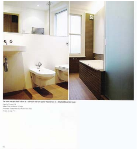
The clean lines and fresh colours of a bathroom that forms part of the extension of a detached Victorian house. 2012/13, London, UK William Tozer Architecture & Design from Architecture & Design 88 pages, 40 images (21)