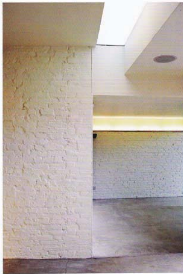
This floor is finished in power-floated concrete to capture the open-ended feel of a building in progress Sandridge, London, UK William Tozer Architecture & Design Photography: Courtney William Tozer Architecture & Design For plan, see page 214