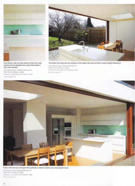
Three kitchen units are white, incorporate brass with Corian countertop and are integrated into a space that includes a utility room and bath. 2012/13, London, UK William Tozer Architecture & Design from Architecture & Design 88 pages, 40 images (18)