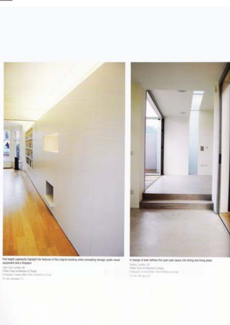
Full height cupboards highlight the features of the original building while concealing storage, audio-visual equipment and a fireplace. 2012/13, London, UK William Tozer Architecture & Design Photography: Graham Miller from Architecture & Design 88 pages, 40 images (11)

Residential Style explores the trends talented designers are adopting in shaping residential interiors around the world. It follows on from the success of IMAGES' Informative Residential Spaces series of books.